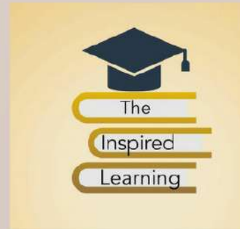
The Inspired Learning